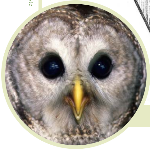
Owl Compound Planned for 2009

Avian Haven strives to act responsibly in the use of forest resources. This annual report as well as past annual reports are available on our website: www.avianhaven.org . If you'd like to receive future annual reports electronically, let us know by e-mail: info@avianhaven.org .